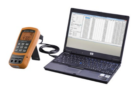
Figure 1 . Automate the recording of continuous readings when you hook the U1731C/U1732C/U1733C to a PC

The handheld LCR meters allow you to test various component types, including secondary components of Dissipation Factor (D), Quality Factor (Q), and Angle Indication of Impedance (θ). This new handheld series also includes other functions that result in a more detailed component analysis. For example, the built-in Equivalent Series Resistance (ESR) function helps you better understand the inherent resistance behavior typically found in capacitors across selected frequencies. DCR is a built-in DC resistance measurement that eliminates using a separate digital multimeter (DMM) for component tests.