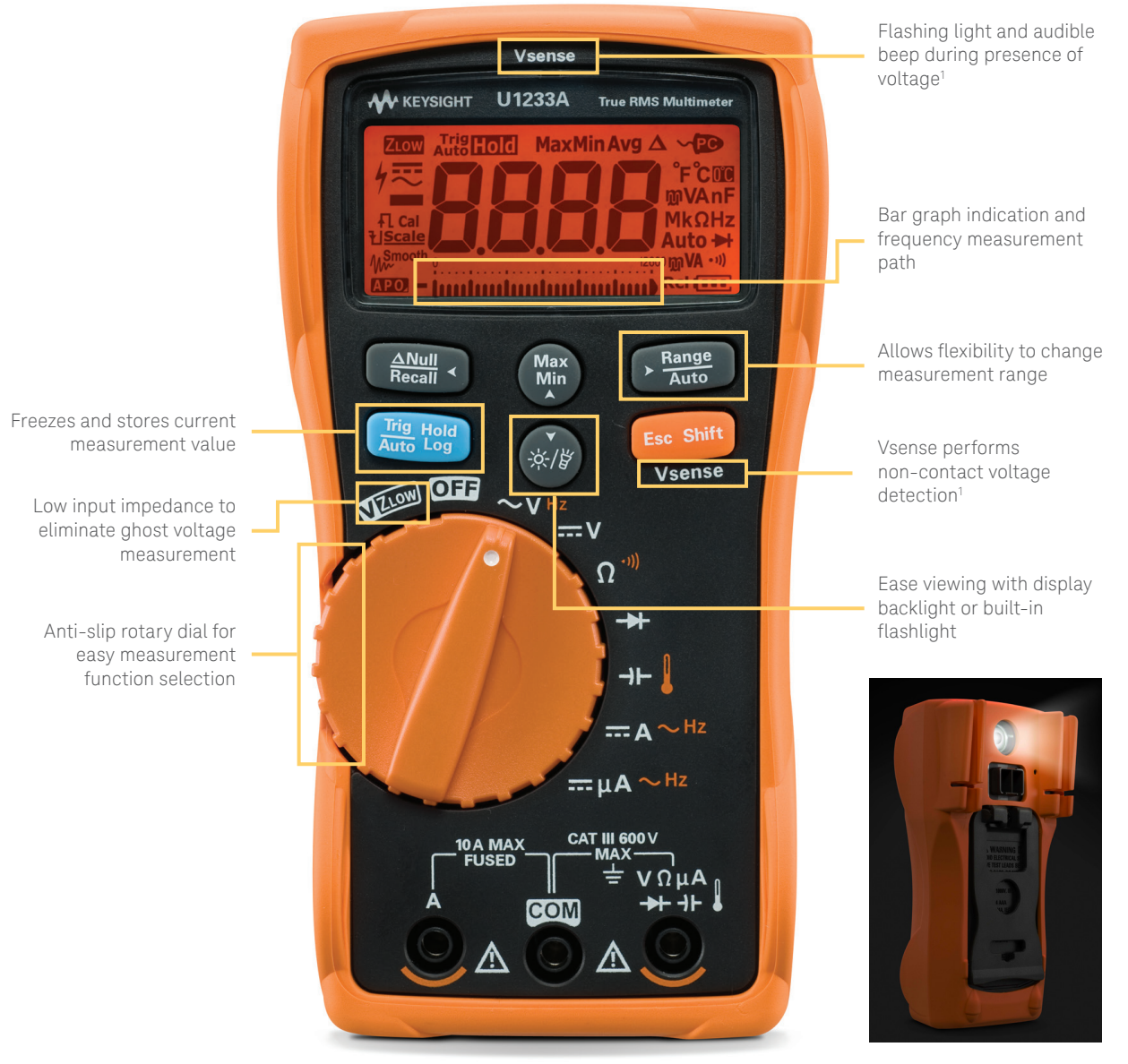
Figure 1. U1230 Series front view

Figure 2. The built-in flashlight as illustrated